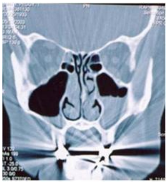
Figure 3: NCCT scan showing partial obstruction of (L) maxillary sinus