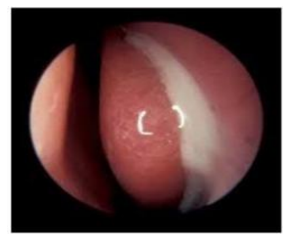
Figure 1: Endoscopic view of muco-purulent discharge in (L) middle meatus

Through DNE the diagnosis of CRS was confirmed by presence of mucopurulent discharge from sinuses into the middle meatus, superior meatus and sphenoethmoidal recess, and blockage of the natural ostium of one or more sinuses by edema or polyps. Confirmation of CRS by NCCT was done by presence of blockage of natural ostia of \geq 1 sinuses in the PNS and complete or partial opacification. [Figure 1- 4]